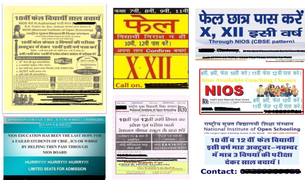
Figure 1: Advertisement Pamphlets collected during the Fieldwork

The fees are nominal and small for admission and examinations. But data from the Current Student Survey indicated that out of expenditure for learners in NIOS was much more than this; more